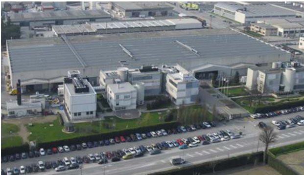
Emerson Network Power Headquarter EMEA

Emerson Network Power™ , a Division of Emerson, is a global company matching technology and design to supply innovative solutions for its customers' benefit.