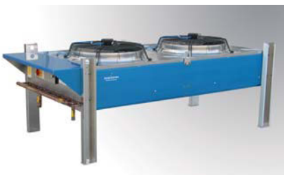
Legs can be used either for horizontal or vertical installation.