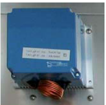
Modulating fan speed control. Silent function during the night.