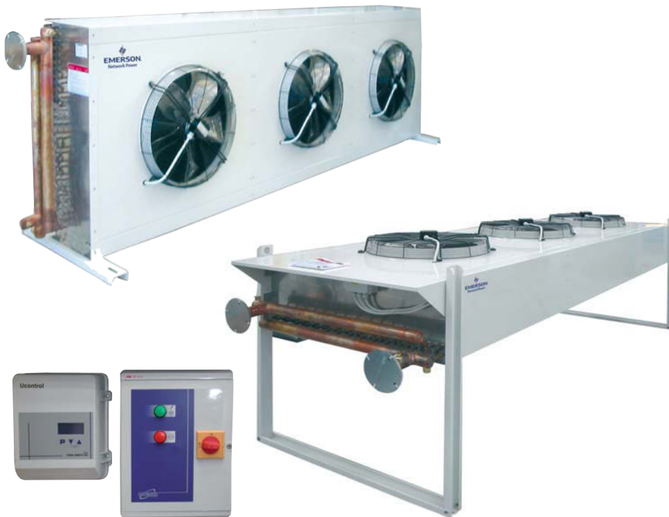
Electric Panel and fan speed control (Three phases Drycooler Modes)

The same Drycooler unit can be installed either Horizontally or Vertically, with simple operation to be done on site, thus reducing transportation and handling costs.