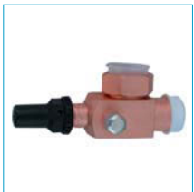
Service valves with pressure tap.