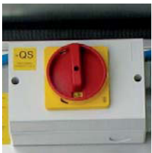
Safety switch. Power supply 50Hz or 60Hz.