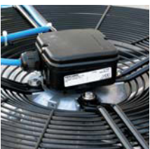
Silent axial fans. IP54 motors.