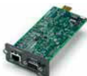
Liebert® IntelliSlot® Communication Card