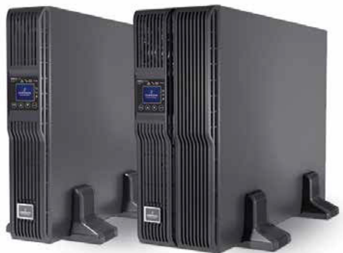
Liebert® GXT4™ 700 - 3000 VA