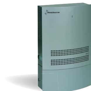
CDF 10 with water tank