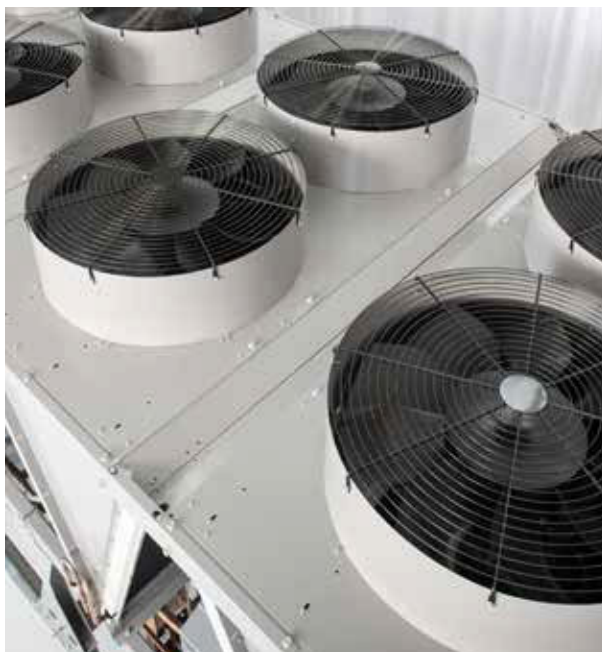
Quiet AeroAcoustic® fan system

For applications that require the unit to quickly recover after a power supply interruption, the 30XV has you covered. Plus, it's more than a quick restart. The 30XV is able to recover to its full cooling capacity within four minutes after the interruption.