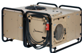
ACM 11 mobile cooling unit