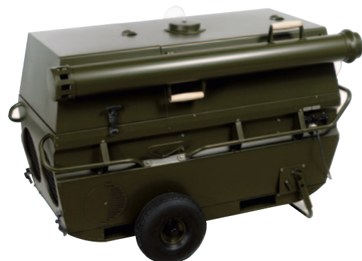
VAM 40 MK II mobile heating unit