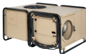
ACM 18 mobile cooling unit