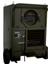
ACM 7 MK II mobile cooling unit