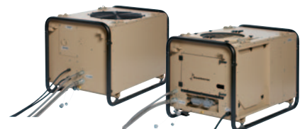
ACM 18 CBRN mobile cooling unit