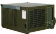
ACM 5 mobile cooling unit