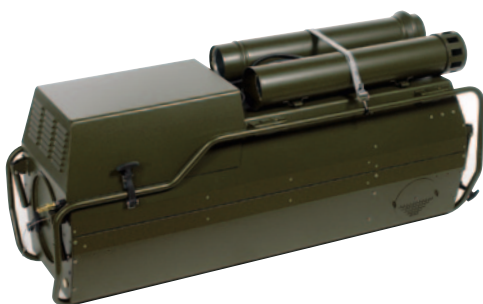
VAM 15 MK II mobile heating unit